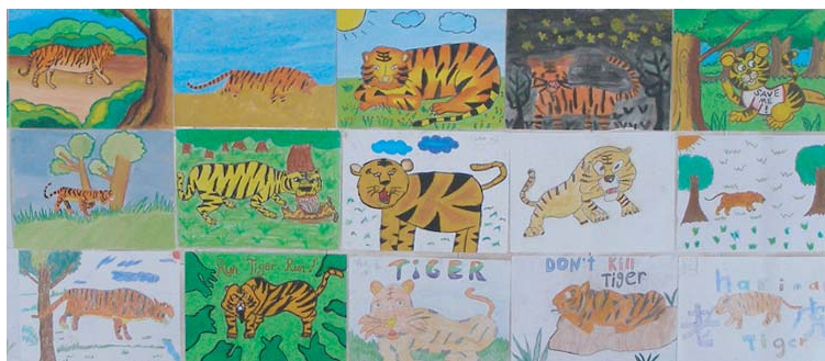
Most of the students' creative artwork was displayed in the school hall for all to appreciate. Some parents were seen keenly reading earnest tiger conservation messages created by their children.

The event was another site-specific component of MYCAT's campaign to reduce local wildmeat consumption and trade, aimed to enhance appreciation for wildlife in the Endau-Rompin National Park among locals. Kahang is the town nearest to the Park.