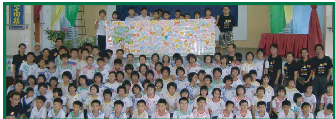
Many thanks to MYCAT partners, JNPC, US Fish and Wildlife Services, Zoo Negara and the academic staff and alumni of SRJK (C) Kahang for their contribution to the success of this programme. Special thanks to all our volunteers – without you, this would not have been possible.