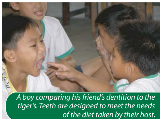
A boy comparing his friend's dentition to the tiger's. Teeth are designed to meet the needs of the diet taken by their host.

An interactive booth also drew many parents, inquisitive to learn more about the use of tigers in traditional medicines, and other threats. The outreach programme ended on a high note, with 18 students rewarded for their creative artwork in the art competition held in conjunction with the programme.