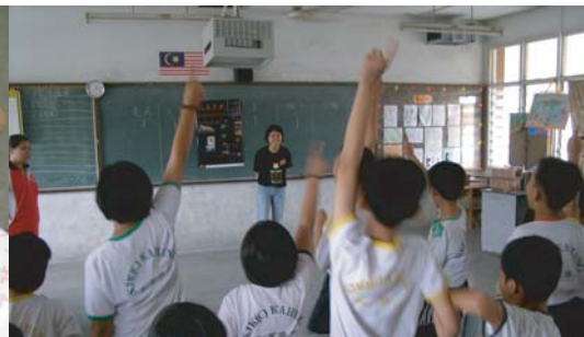
The students actively participated in all the sessions, asking questions unabashedly, and attempted all the exercises whole-heartedly.

Towards the end of the session, students wrote down their pledge to help tigers and other wildlife in Endau-Rompin on animal cut-outs. These were later stuck on a banner, now displayed in the school as a reminder of their commitment.